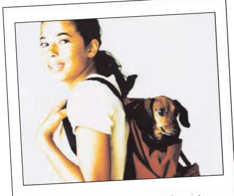
Me with Hotdog and my backpack